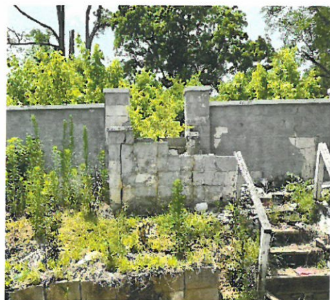
524 CAMBRIDGE STREET WYAL 35227