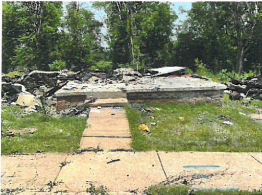
404 14 TH COURT NORTH 35204