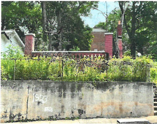
1523 FRED L SHUTTLESWORTH DRIVE 35234