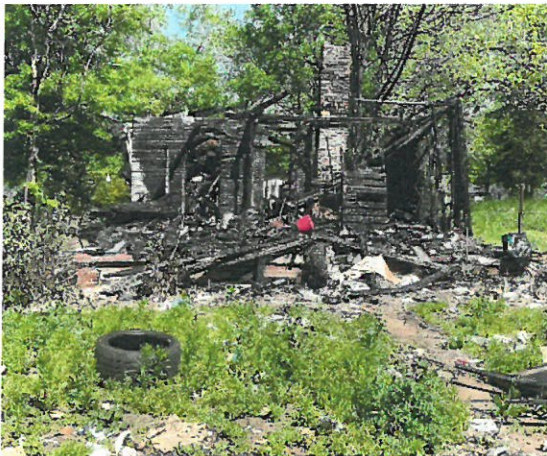
22 5 TH AVENUE SOUTH 35205