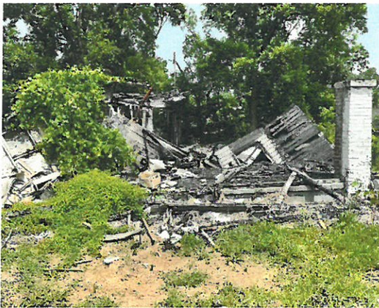
531 BUFFALO PLACE 35224