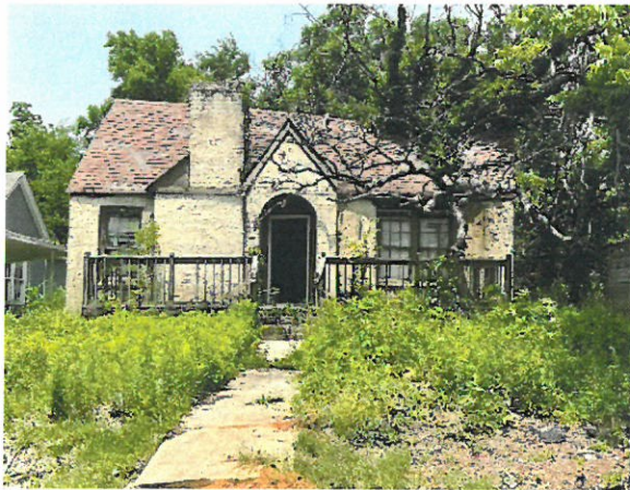
1828 PRINCETON AVENUE SW 35211