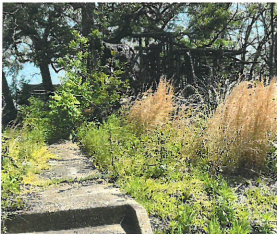
3011 PRINCE AVENUE ENSLEY 35208