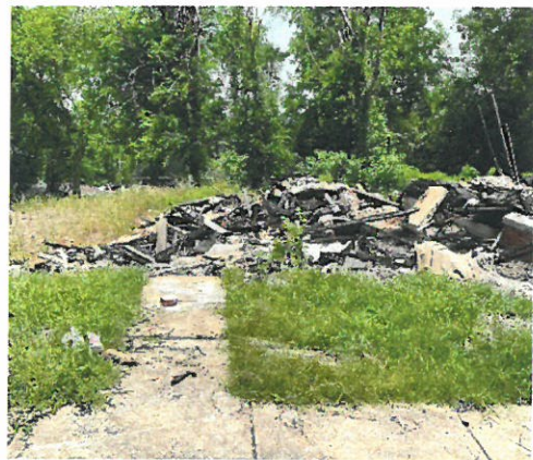
402 14 TH COURT NORTH 35204