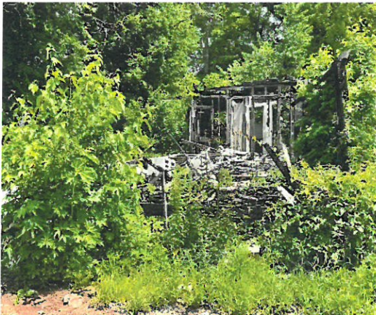
2717 AVENUE B 35218