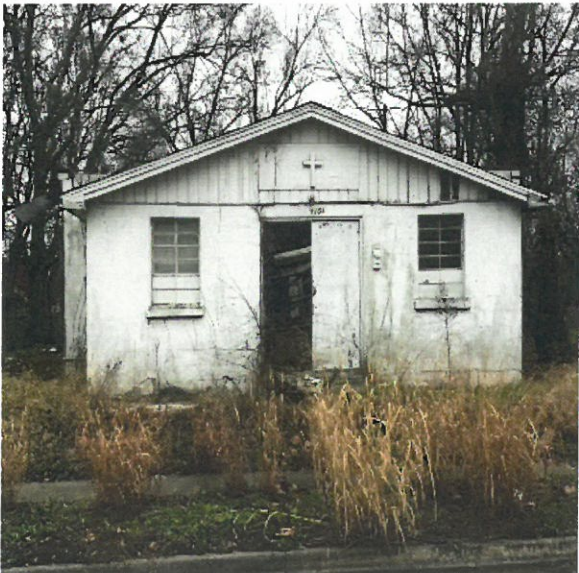
3161 30 TH CT N 35207