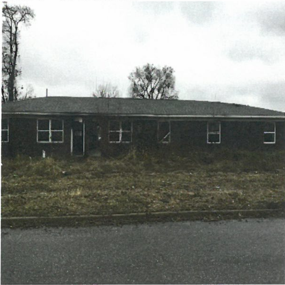
1018 21 ST ST ENS 35218