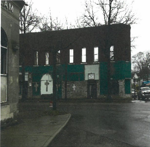
4401 7 TH AVE WL 35221