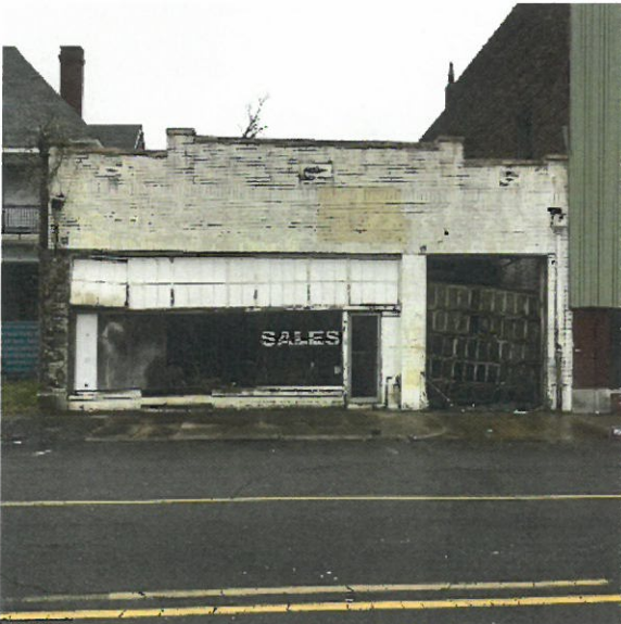
2304 AVENUE E 35218