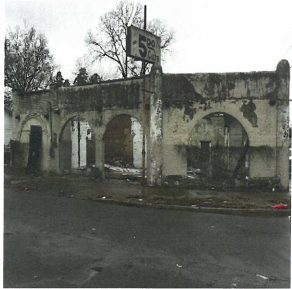
3144 PIKE RD 35218