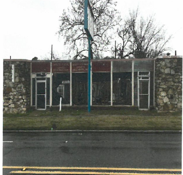
2900 BESSEMER RD EN 35208