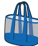
OVERSIZED TOTE BAG