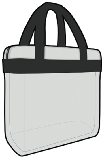
12" X 6" X 12" CLEAR PLASTIC BAG ALLOWABLE STORAGE AREA