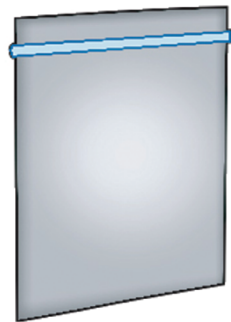
1-GALLON PLASTIC FREEZER BAG

NOTE: WALLET, BILLFOLDS, CLUTCHES LARGER THAN 1" X 4.5" X 8.5" ARE PROHIBITED